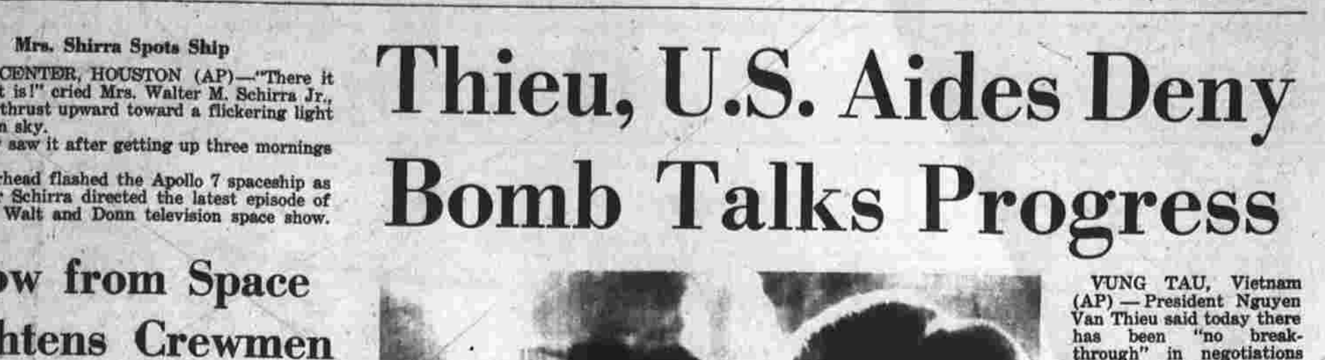
YUNG TAU, Vietnam (AP) - President Nguyen Van Thieu said today there has been "no breakthrough" in negotiations with Hanoi for a bombing halt of North Vietnam, and Washington sources blasted him up.

Thieu qualified his announcement by saying there are "certain things" about which he is not informed by Washington. However, administration spokesmen in the U.S. capital said they were unaware of any impending bombing halt and denied reports that North Vietnam has accepted mutual de-escalation terms. Asked if there were any basic differences between Saigon and Washington over the peace negotiations, a spokesman said: "When President Johnson says the position of the United States government remains unchanged and when I say the position of the government of South Vietnam remains unchanged, I think we have occurred in this."