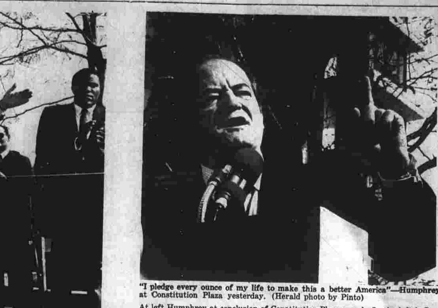
"I pledge every ounce of my life to make this a better America" - Humphrey at Constitution Plaza yesterday.

At left Humphrey at conclusion of Constitution Plaza speech. On the left is Second District Congressman William St. Onge, and next to him is First District Congressman Emilio Q. Daddario.