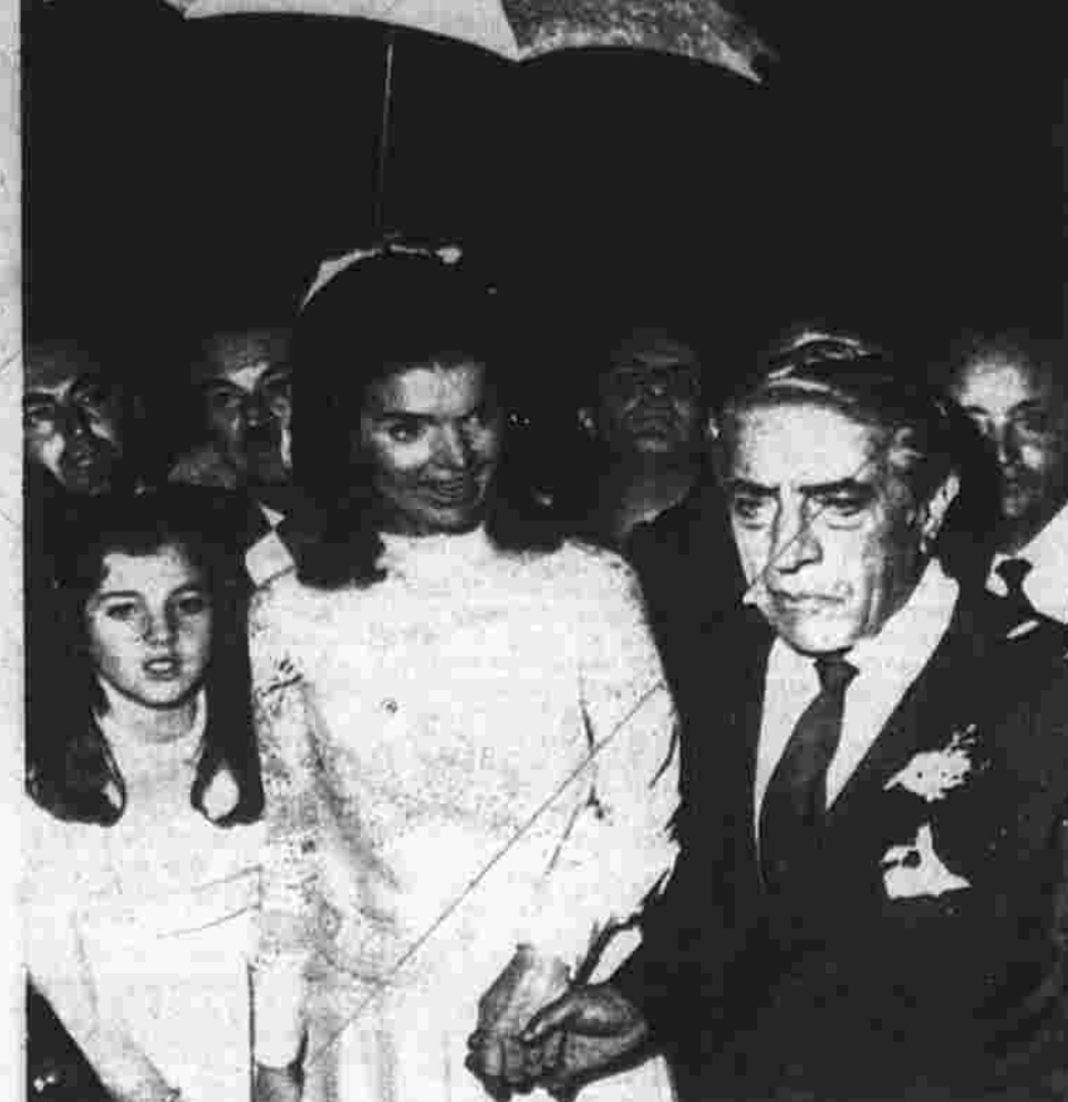
The former Jacqueline Kennedy and her husband Aristotle Onassis walk in the rain from chapel after their wedding Sunday on Greek island of Scorpios.