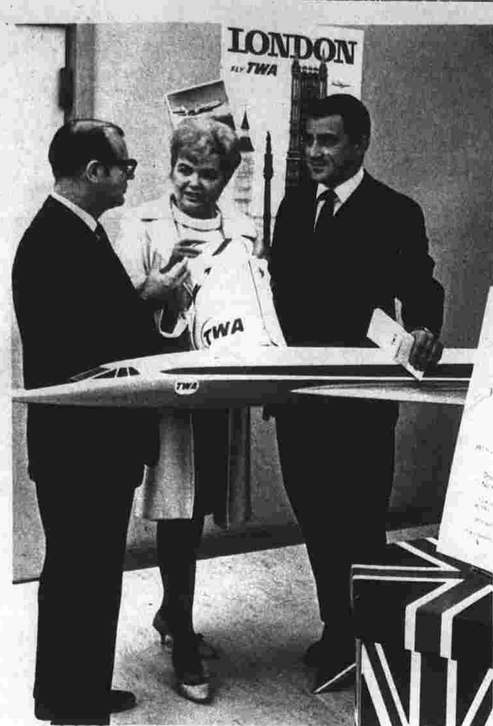
Wins Trip to Bermuda

Bridgeport, with 3,149 claims was the state leader last week. It was followed by Hartford with 2,016, New Haven with 2,396, and Waterbury with 2,270. Manchester was 14th among the state's 20 offices.